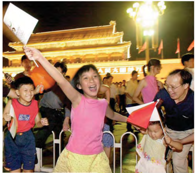
▲ People celebrate in Tiananmen Square after Beijing won the bid for the 2008 Olympic Games.

As countries are increasingly linked through technology and trade, they will have more opportunity to influence each other politically. When the U.S. Congress voted to normalize trade with China, supporters of such a move argued that the best way to prompt political change in China is through greater engagement rather than isolation. Another sign of China's increasing engagement with the world is its successful campaign to host the 2008 Summer Olympics in Beijing.