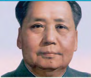
Mao Zedong 1893–1976

Born into a peasant family, Mao embraced Marxist socialism as a young man. Though he began as an urban labor organizer, Mao quickly realized the revolutionary potential of China's peasants. In 1927, Mao predicted: