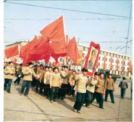
The Red Guards

The Red Guards were students, mainly teenagers. They pledged their devotion to Chairman Mao and the Cultural Revolution. From 1966 to 1968, 20 to 30 million Red Guards roamed China's cities and countryside causing widespread chaos. To smash the old, non-Maoist way of life, they destroyed buildings and beat and even killed Mao's alleged enemies. They lashed out at professors, government officials, factory managers, and even parents.