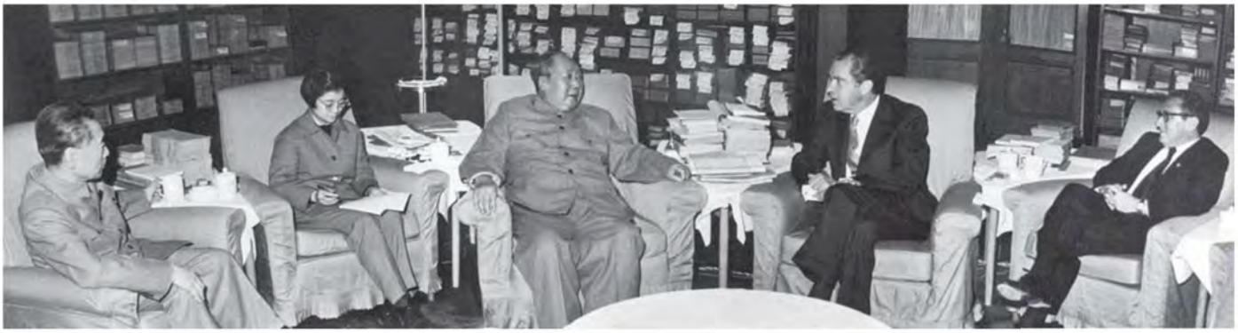
▲ Zhou Enlai, a translator, Mao Zedong, President Nixon, and Henry Kissinger meet in Beijing in 1972.

Instead of saving radical communism, however, the Cultural Revolution turned many people against it. In the early 1970s, China entered another moderate period under Zhou Enlai (joh ehn•ly). Zhou had been premier since 1949. During the Cultural Revolution, he had tried to restrain the radicals. A